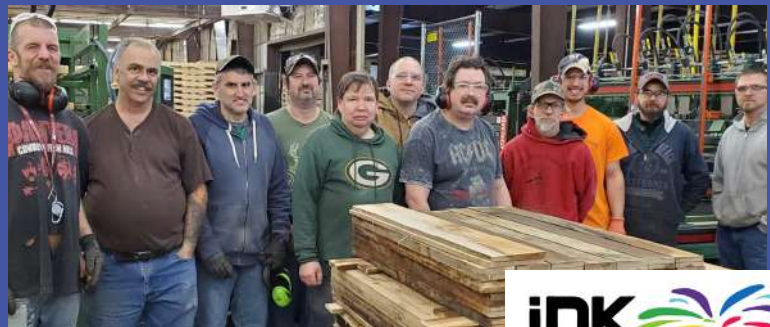
ODC Pallet Division employees in Plover.

THANK YOU TO ALL OF OUR CUSTOMERS, WHO ARE PARTNERS IN ODC'S MISSION!